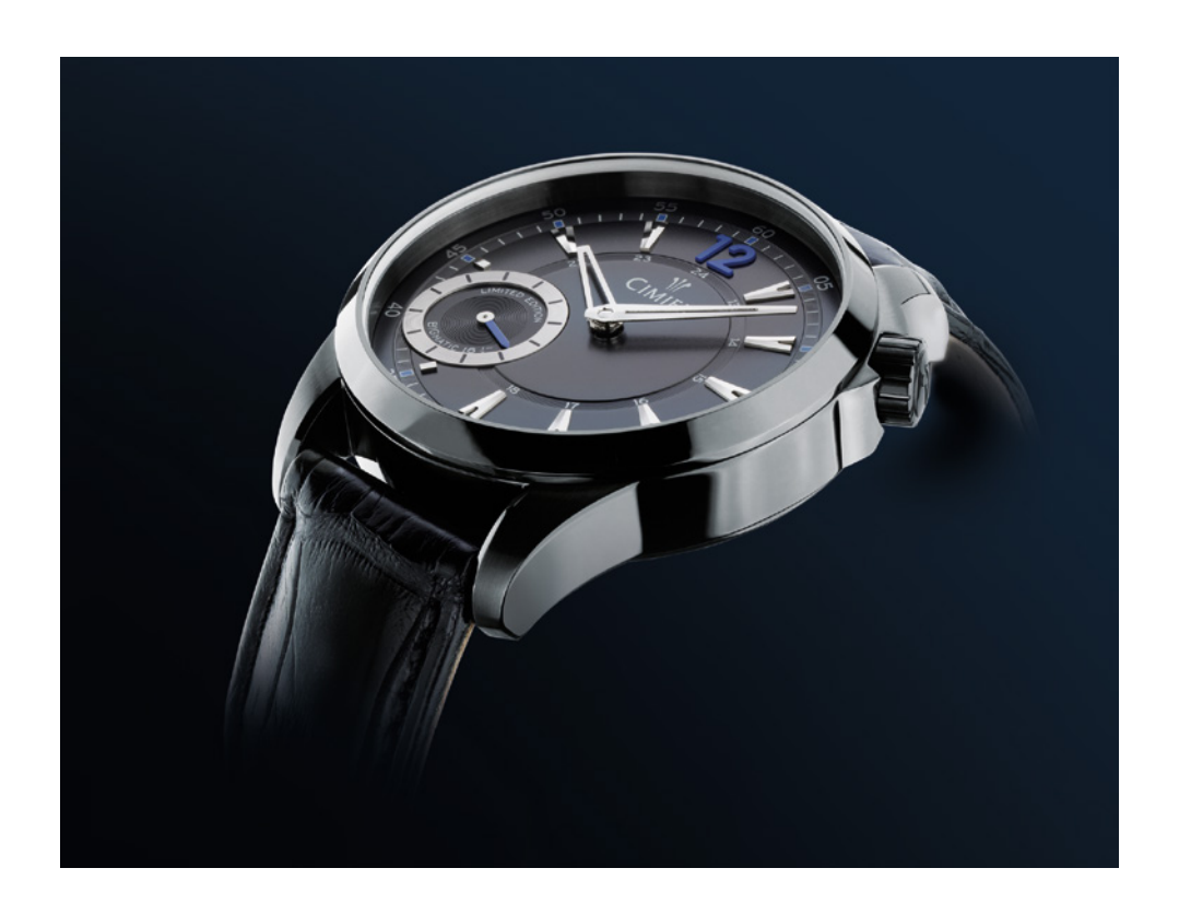
"For those who enjoy wearing timeless aesthetics and advanced technology."

High standards from a unique timepiece, the result of high quality watchmaking.